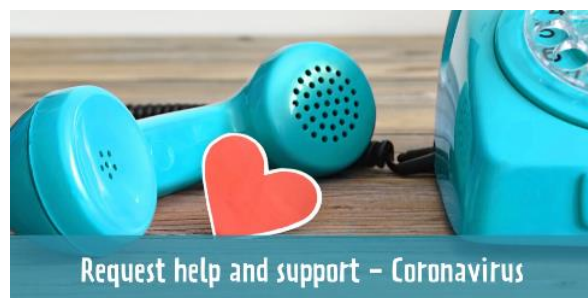
Figure 1 Telephone helpline

We continue to receive calls from members of the public who need help, so please promote the number where you can to anyone who needs assistance and help to support Northamptonshire's vulnerable residents. As a reminder, the dedicated support line is: